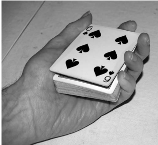
Photo 1. Magician's View

spectator's eyes further from the top of the deck.) Continuing the squaring action, lift the inner ends of the cards about \frac{1}{4} inch, and maintain that position with pressure from your left fingers pressing the left side of the cards into the heel of your hand. (Photo 1.) You're now ready for Tilt. Since you will now be patterning about the upcoming face-up rise, I suggest you tilt the top of the deck to the right and towards you. This will obscure the tilt break from anyone at your right. (Photo 2. Photo 3 is the spectator's view if you don't tilt the deck as recommended.)