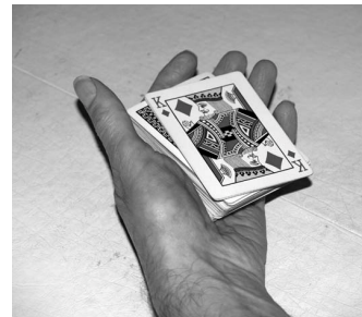
Photo 14. Rotation almost completed

Now, being careful to keep the cards horizontal, un-cock your wrist briskly, and open your left fingers. (Photo 13) The card will begin a counter-clockwise rotation.